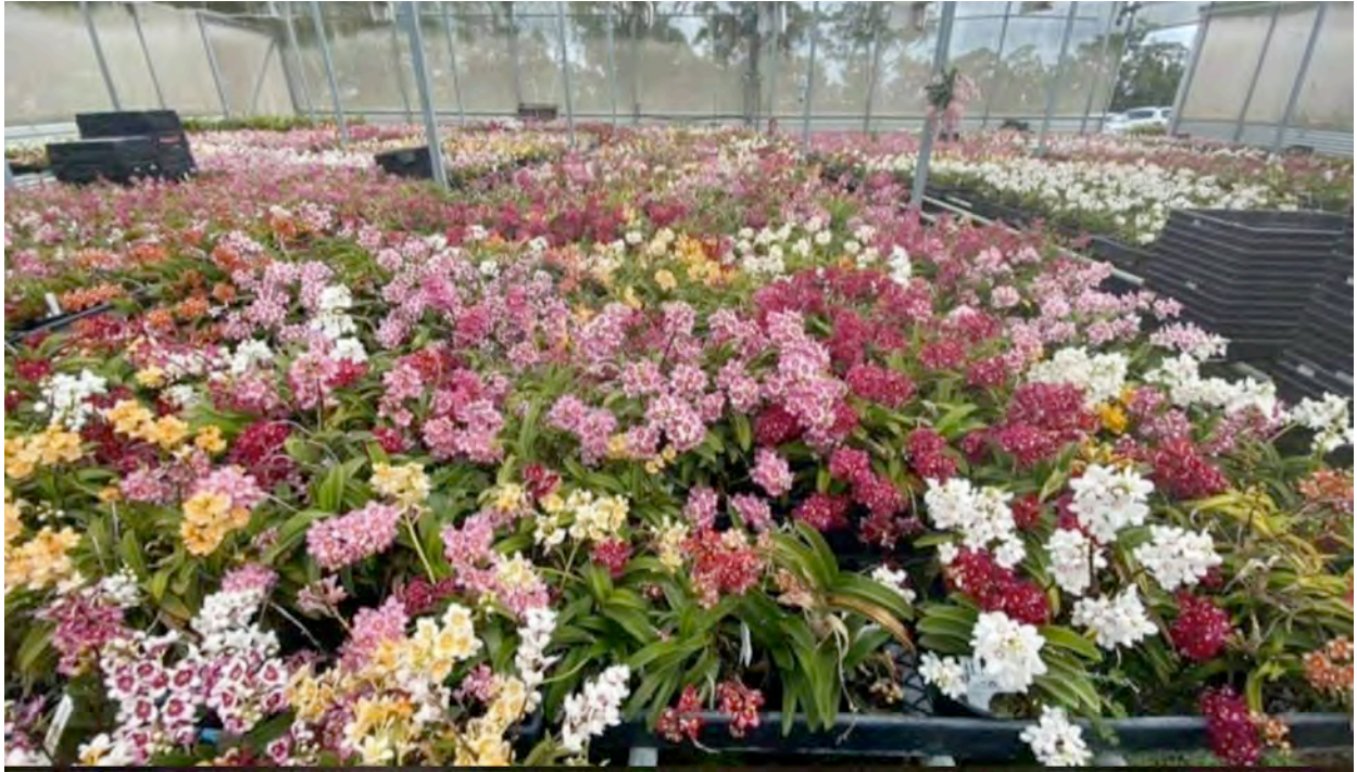
Barrita Orchids Sarcophilus in bloom (Barrie)