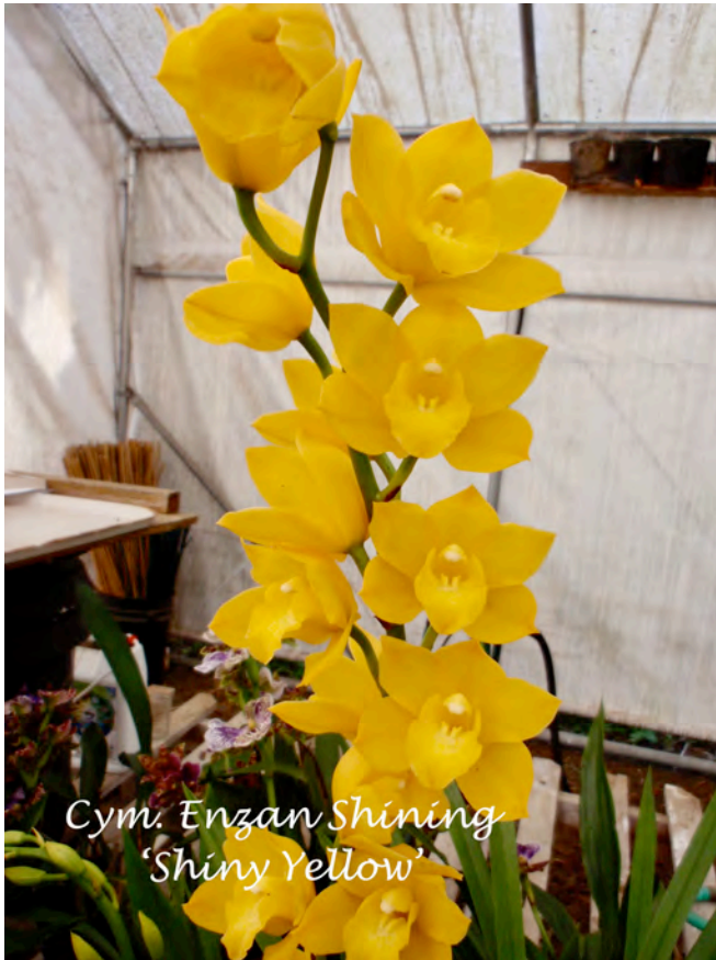
Cym. Enzan Shining 'Shiny Yellow'